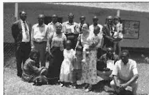
Members of new church in Eldoret

Please continue to pray for this infant church here in Eldoret.