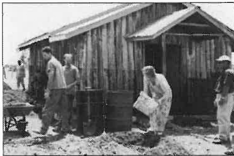
Laboring to put a concrete floor in the Ndururi GBC building

Even with greater-than-expected interest in a two-week mission trip and a great turnout for our first meeting, only four actually went. Even the four of us had decided not to go. Fortunately, we all decided this at different times and were able to encourage each other into sticking with it.